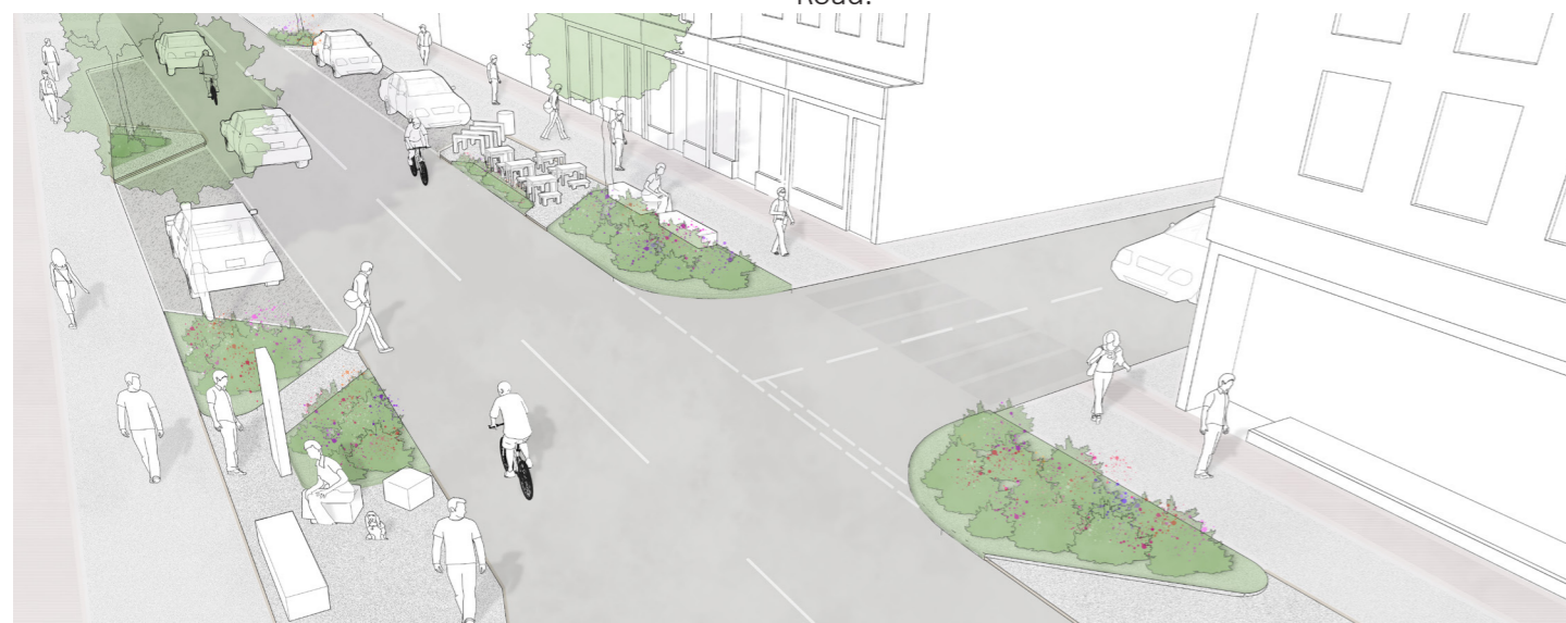
Indicative northerly view along Croydon Road and junction with Mount Pleasant Road

When developing these ideas, we plan to make Croydon Road a healthier and more pleasant place to be. By providing spaces for people to meet, we'll be encouraging people to spend more time in the street. This enhanced 'dwell time' will support local businesses and support the overall economic vitality of Croydon Road.