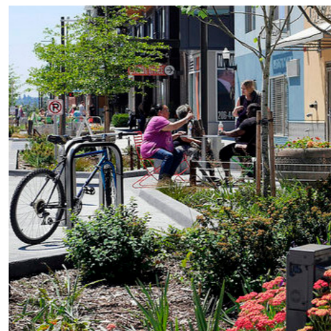
Example of dwell spaces in Seattle, USA