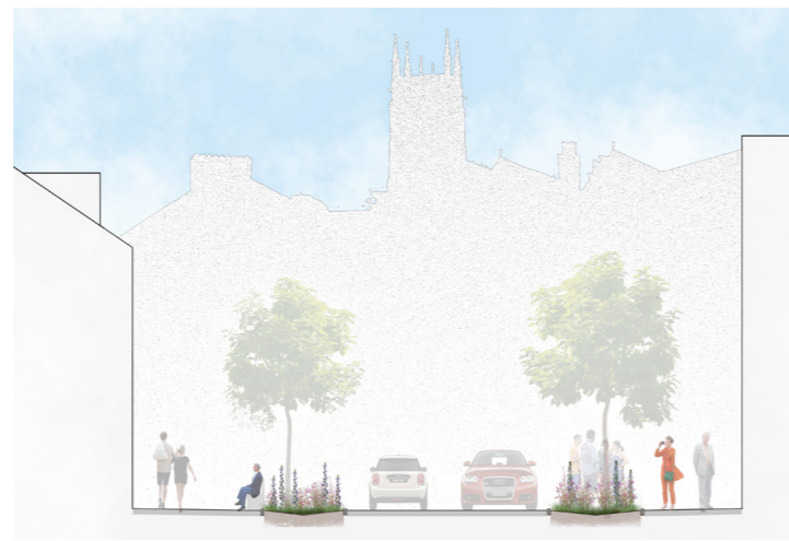
Indicative southerly sectional view through Croydon Road

A principle objective is to make Croydon Road a more pleasant environment for people to shop and to spend their leisure time. The street is currently